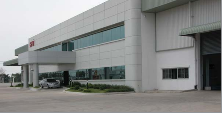
XRF's state-of-the-art assembly plant in Karbinburi, Thailand