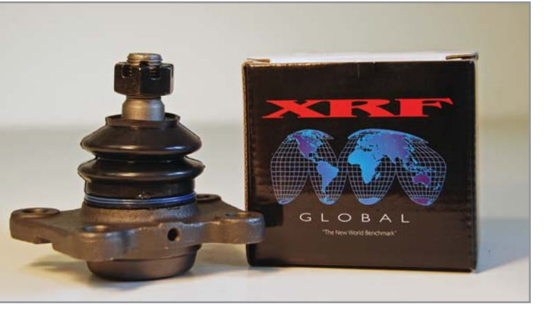
Forged ball joint with bellows anchored boot