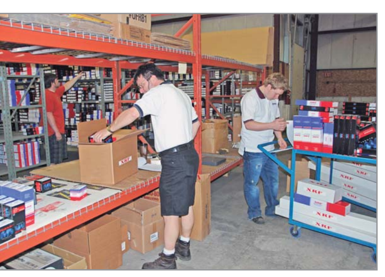
Inside and outside views of XRF's packaging and distribution center in Port Huron, Mich.