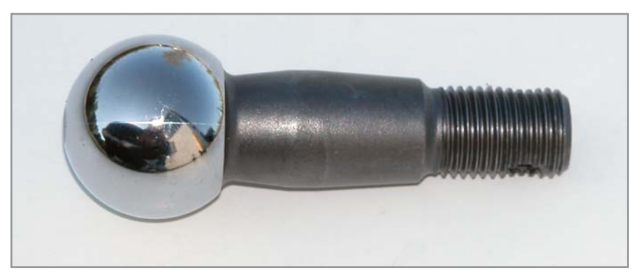
An XRF burnished, perfectly round ball stud with special heat treatment for omnidirectional strength.

only with idler arms but also we have replaced all metal-stamping ball joints with much-stronger, longer-lasting forged parts. Many of our forged ball joints are three times stronger than our competitors' part yet are priced about the same."