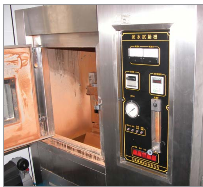
Chassis parts are tested for wear with a special mud-spray tester and a salt-spray tester.